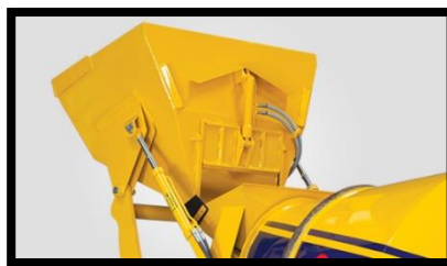
Self Loading Arm with Hatch Bucket