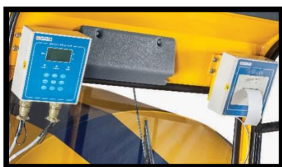
Concrete Batch Controller