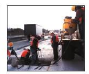
Highway Dowel Rods